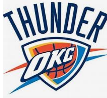
Oklahoma City Thunder